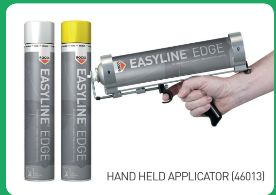
HAND HELD APPLICATOR (46013)